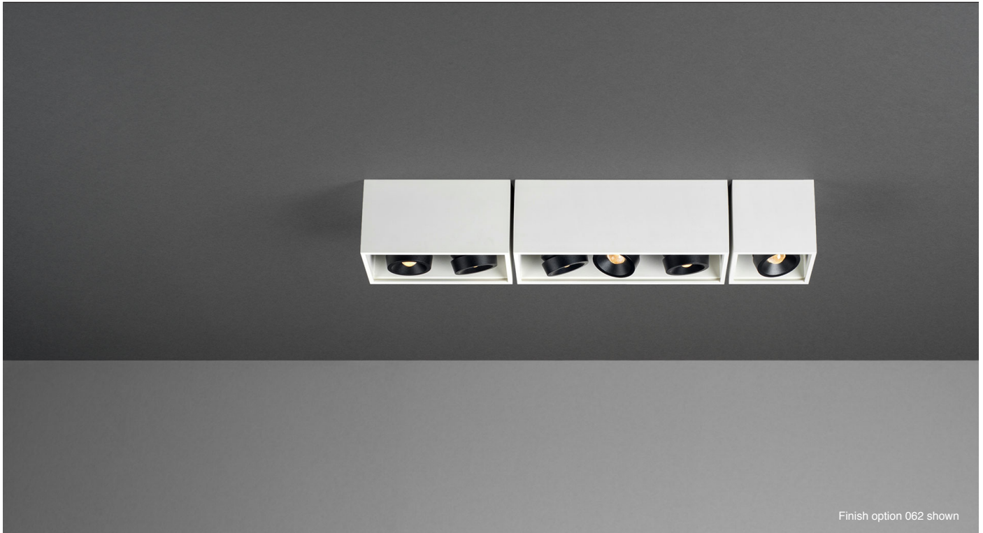
Finish option 062 shown