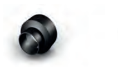
L670232 Plastic Box