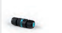
L670243 IP Connector