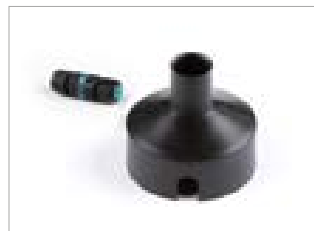
L670220 KIT: draining junction + IP connector